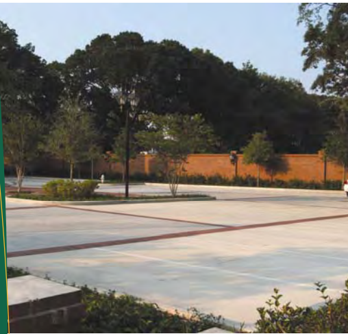
With a long life-span and good reflectivity, concrete parking lots save money up front and over the long term.

Twenty percent of America goes to school every day (55 million students and 5 million educators). Too many of these schools are inefficient and miss important opportunities to reduce operational costs, foster learning and protect student health. Public and private school officials alike are realizing that going green makes sense. If a green school saves $100,000 per year in operational costs, that may enable the hiring of two additional teachers, buy 200 new computers or purchase 5,000 new textbooks. If all new school construction and school renovations went green starting today, energy savings alone would total $30 billion over the next 10 years. Green schools typically cost less than an additional $3 per square foot to build, an investment that is paid back within a few years of operation. Over the lifetime of the school, the savings keep adding up. By promoting the design and construction of green schools, we can make a tremendous impact on student health, test scores, teacher retention, school operational costs and the environment.