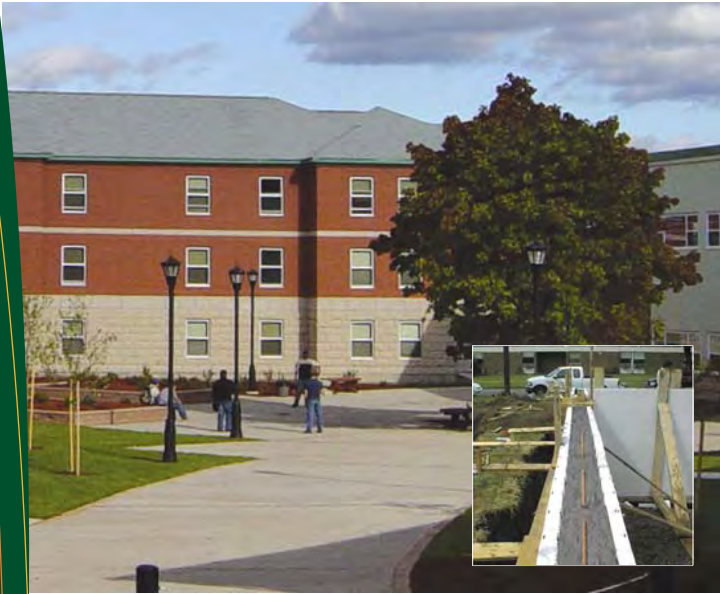
Insulated concrete provides superior energy efficiency and beautiful finishing choices, with the traditional durability and strength of concrete.