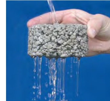
In pavement areas, pervious concrete keeps rain and pollutants out of natural waterways.

In response to growing environmental and economical forces, owners, developers, architects and engineers are seeking efficient and innovative building solutions that conserve non-renewable resources. Increasingly, concrete is being recognized for its strong environmental benefits in support of creative and effective sustainable development as well as being helpful in achieving "LEED™ for Schools" certification. When considering the lifetime environmental impact of a building material—extraction, production, construction, operation, demolition and recycling—there is no better choice than concrete.