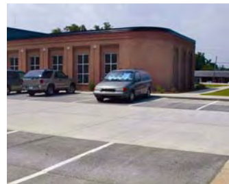
Parking areas, using both conventional and pervious concrete, provide cost-effective storm-water management